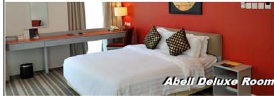
Abell Deluxe Room

Just 11 km from the Kuching International Airport or a short 15 minutes' drive, the central locality provides an ideal check point to explore nearby places of interest.