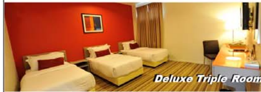
Deluxe Triple Room